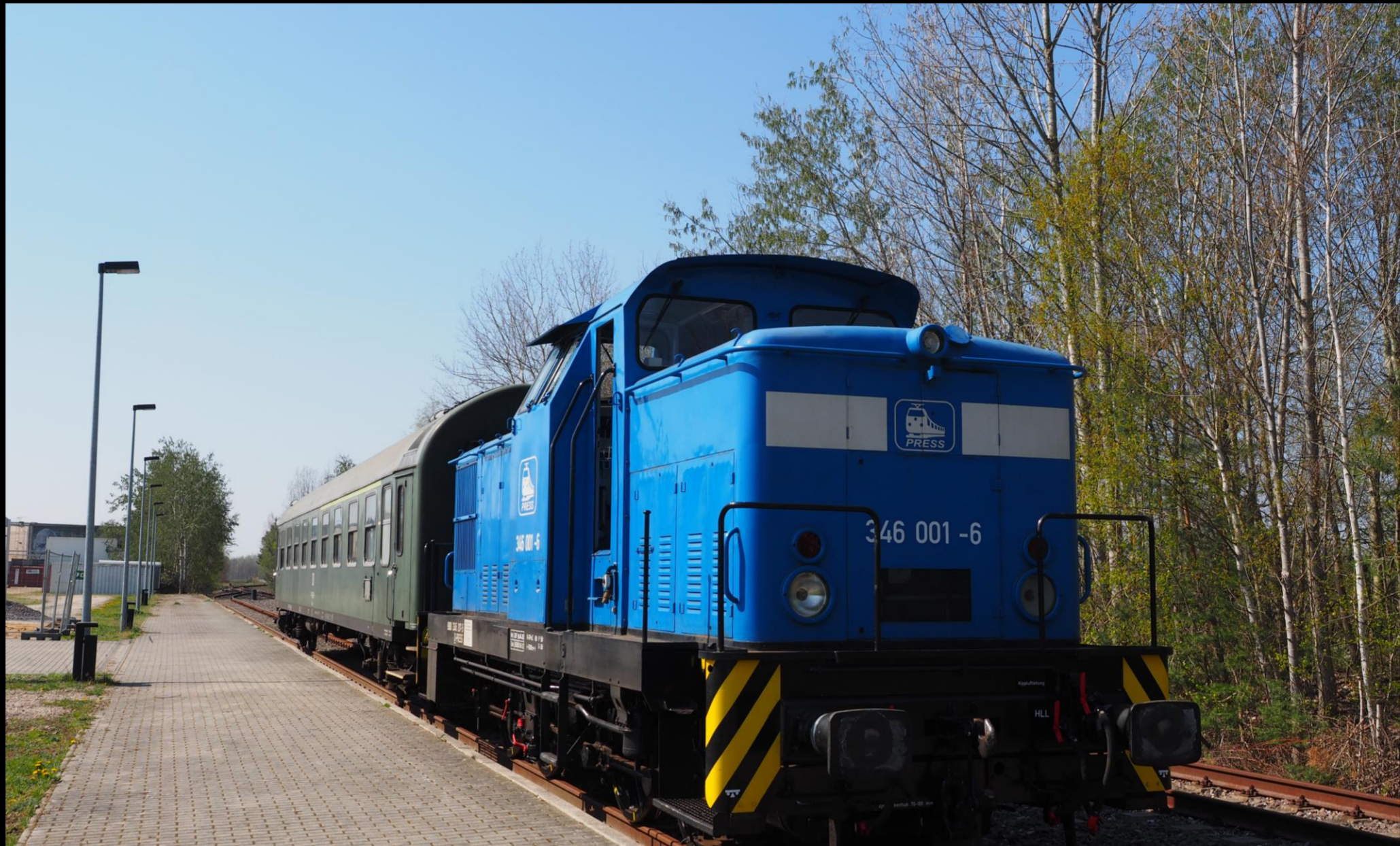
Charter train from Leipzig Main station to Ferropolis and back 5 coaches/400 seats