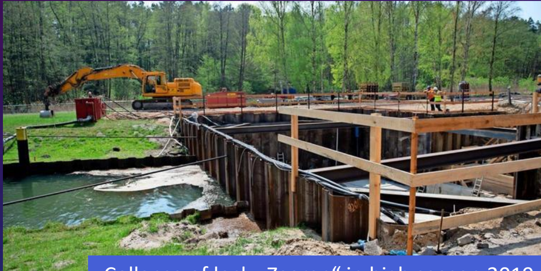
Collapse of lock „Zaaren“ in high season 2019

“The value, added of water tourism, does not decrease linearly with each closed lock. It collapses directly if only one lock on the circuit system fails.”